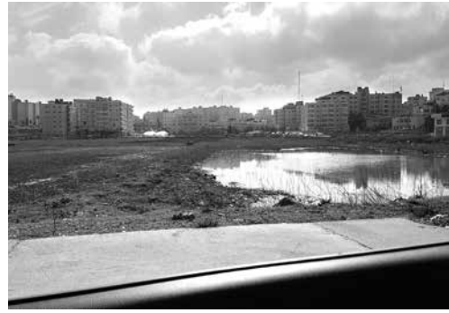
Figure 8. Rainwater trapped in scattered spots in al-Balu' in 2016.

gradually. However, the nature of this new development was different from previous development. It included several governmental and national security buildings alongside new commercial and retail facilities such as shopping centers. In addition, new residential buildings were erected, but of types different than the villas, semi-detached housing units, and detached homes built in the 1980s.