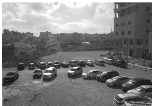
Figure 11. New infrastructure and development trends around al-Balu' and where the seasonal pond used to occur.