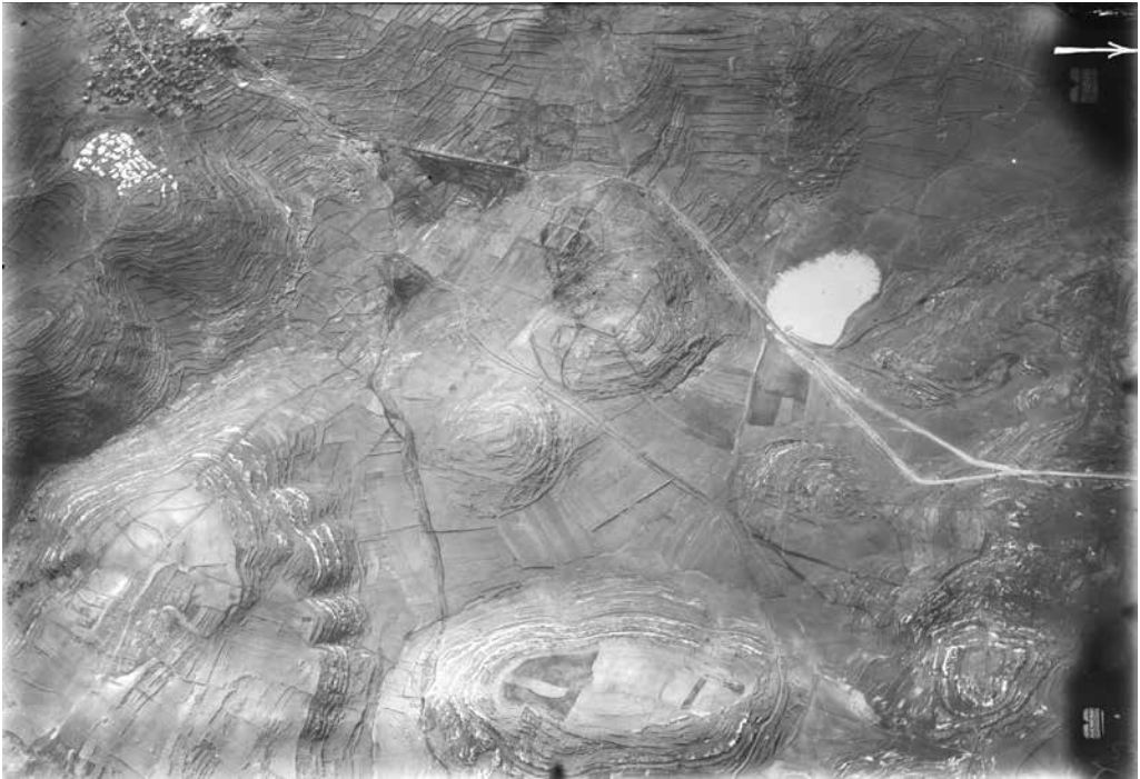
Figure 2. Aerial photograph showing al-Balu' pond in relation to the historic center of al-Bireh, 1918, Bavarian State Archives, online at www.gda-old.bayern.de/bestaende/viewer/viewer.php?show=/bestaende/palaestina/bayhsta_bs_palaestina_0597 .

while the rain that falls in the adjacent eastern slopes is collected by another web of valleys that channel rainwater to the Jordan Valley and ultimately into the Jordan River and the Dead Sea. 4 The water collected in al-Balu' is part of a very small share of the rainwater that does not find its way into either of these widespread webs of valleys. The seasonal pond could usually be seen between the start of the rainy season in December and the spring season (April–May). This could vary based on the amount of rainfall and temperature every season. In a mountain region, which lacks permanent surface water areas, balu' areas and similar seasonal or permanent surface water are exceptional natural features, worthy of investigation and protection.