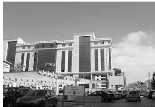
Figure 10. Current development trends around al-Balu'.

Today, al-Balu' area is considered a key part of the urban development of Ramallah–al-Bireh's urban fabric. The area's development includes public facilities, commercial and retail facilities, residential houses and buildings, governmental buildings, office buildings, and many other urban facilities. The topography of the area is mainly flat, which facilitated such rapid urban development. In addition, the scarcity of land available for new development offset the cost of building foundations, which otherwise may have hindered building in such an area. The topsoil from construction sites in al-Balu', it is worth pointing out, is considered a precious commodity and is sold for gardening activities in other places.