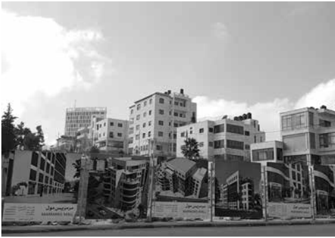
Figure 9. Current development trends around al-Balu'.