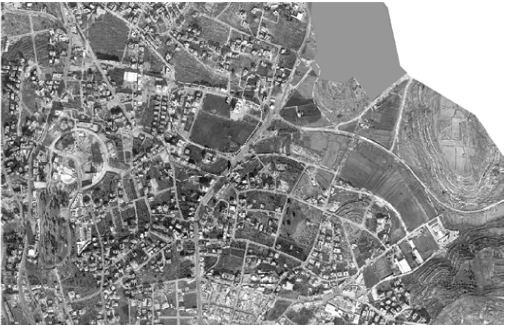
Figures 5 and 6. Maps showing al-Balu' and surrounding urban development of al-Birah and Ramallah in 1996 and 2015, with the darker plateau area surrounding the pond. This map is based on a map produced by al-Birah Municipality, with lines and borders by the author.