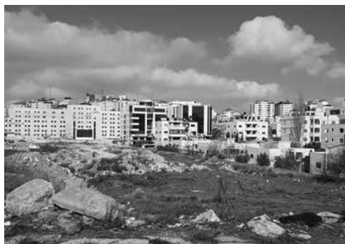
Figure 12. New infrastructure and development trends around al-Balu' and where the seasonal pond used to occur.

This article has tried to shed light on a distinctive natural feature of the landscape of Palestine. By studying Balu' al-Bireh and balu' Dayr Ballut, we tried to highlight the demise of such residual natural spaces within the contemporary landscape of Palestine. First, the article tried to show example of surviving balu' in Dayr Ballut. Dayr Ballut's balu' survived due to a complex web of geopolitical and local agro-ecological factors. Nevertheless, an in-depth investigation shows not only the preservation of some ecological features of the system, but also changes in the nature and structure of the agricultural activities associated with the area. Second, the article examined the demise of Balu' al-Bireh as a residual space within the urban expansion of the city. The rapid urban development of al-Bireh–Ramallah reached the balu' area and included it within larger processes of real estate development. In this case, urban development caused a more drastic transformation. The urban transformation contributed not only to eliminating the agro-ecological activities, but also to the natural feature itself – including the soil and the wetland – gradually vanishing.