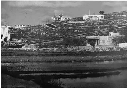
Figure 7. Partial view of the seasonal pond during winter, 1980s.